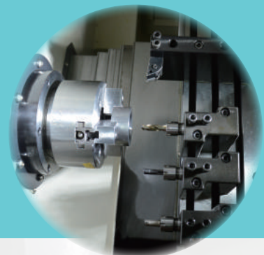
櫛式刀座 Gang tool plate